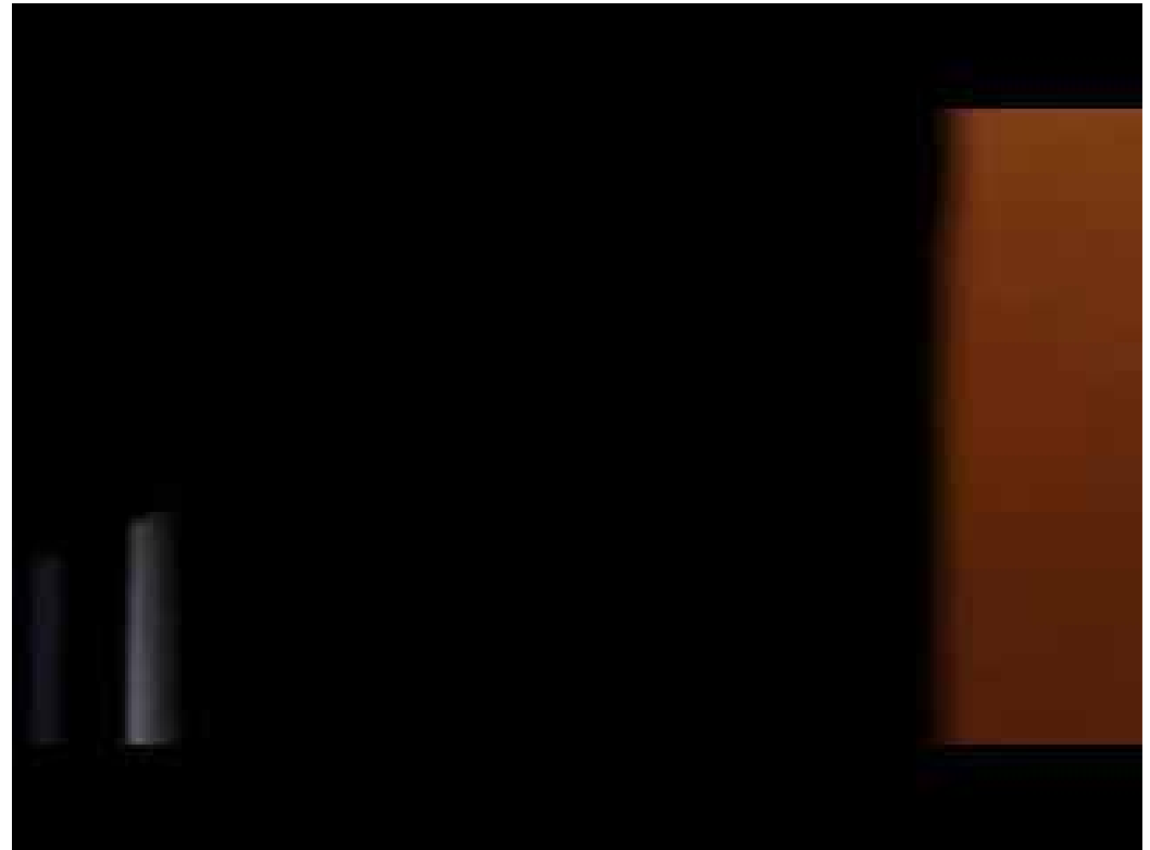
Domino Grey Butterfly Affect Part I Primal Themes music video

- James Moore independentmusicpromotions.com